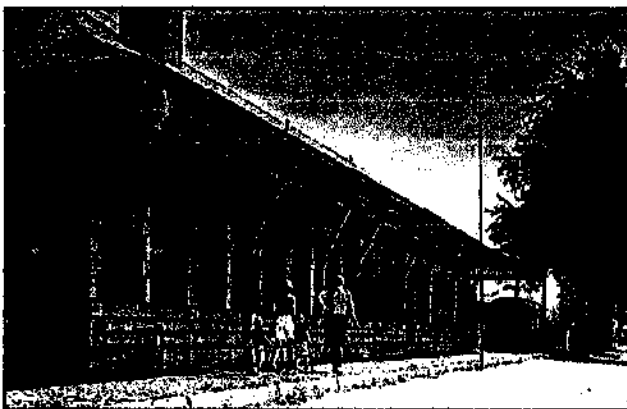
Conneaut Historical Railroad Museum

Another item to keep in mind is a visit to the Conneaut Historical Railroad Museum, located three blocks north of the lodge at 363 Depot St. The museum does not officially open until Memorial Day, but will be open from 3 - 4:30 PM on May 2 nd for Evergreen. This is a very nice museum located in the original depot, something well worth visiting if you are in town. There is no charge for admission.